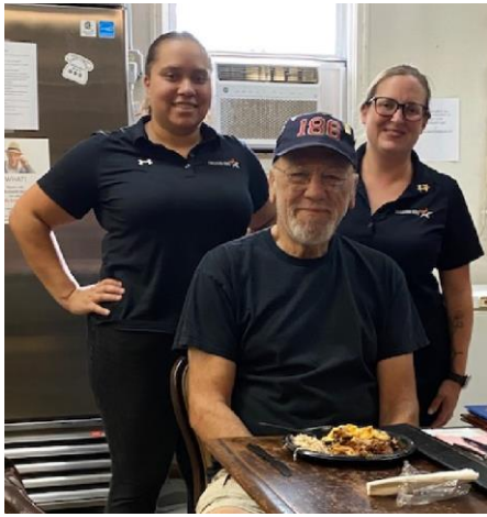
You know what kind of grin this is.