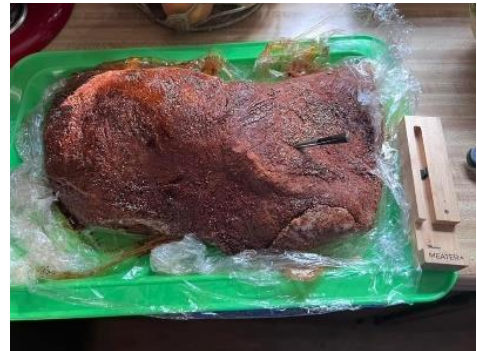
That's a hunk of meat!

At the end of the luncheon there were no beef, hamburgers or hot dogs left!