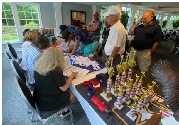
Getting everyone signed in.

In spite of the weather, everyone had a fun time. We raised a lot of money for the Post and we look forward to next year's event!