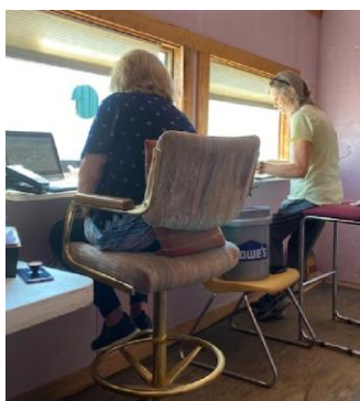
The ticket booths were covered.

Even though the weather people called for rain on Sunday, families still showed up to have a good time.