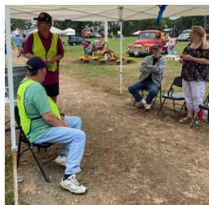
The gates had security.