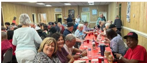
Full tummies, happy faces