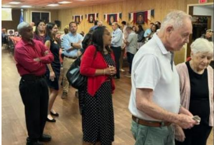
The chow line was long, but worth the wait.