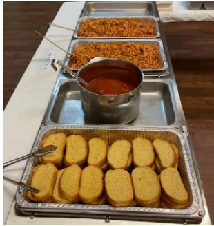
Time to dig in!

Thanks to all that made this a nice evening.