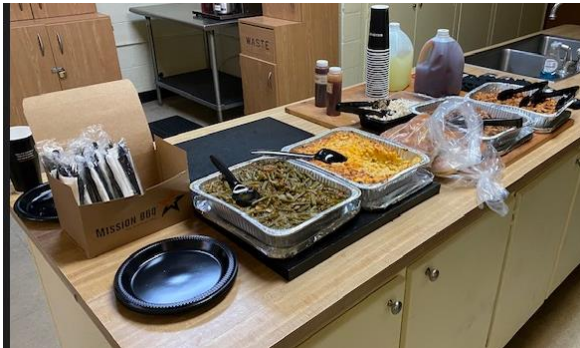
Plenty for everybody!

Thanks again to our friends at Mission BBQ! Stop by and visit with us. We're there every morning from 9am till noon, Monday through Saturday. You never know what you'll hear or see most mornings.