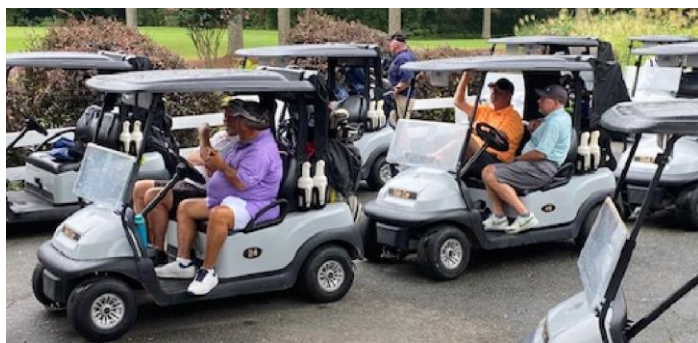
Golfers start your engines... I mean start your carts.