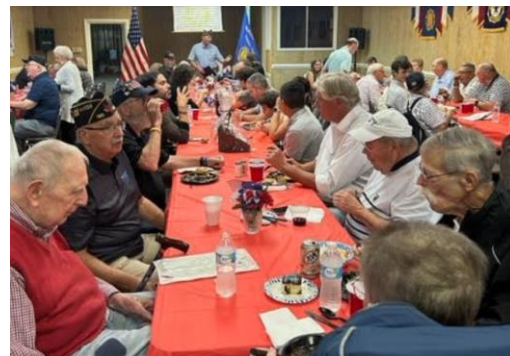
Great crowd in attendance.

There was standing room only at the September Dinner meeting. Members and guests were treated to a dinner from Mission BBQ. Guests included girls and boys from Boys and Girls State. A young man representing the Youth Cadet Law Enforcement Program was also in attendance.