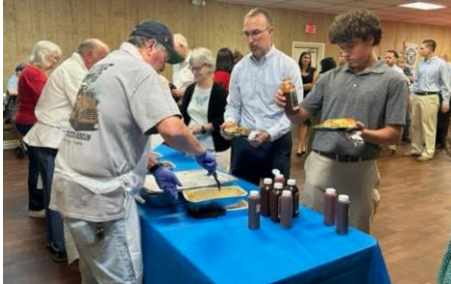
Time to dig in!