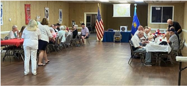
A good crowd.