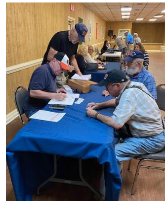
Getting membership renewed.