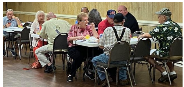
Good food – good friends!