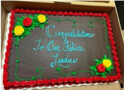
A giant cake awaited the guests.