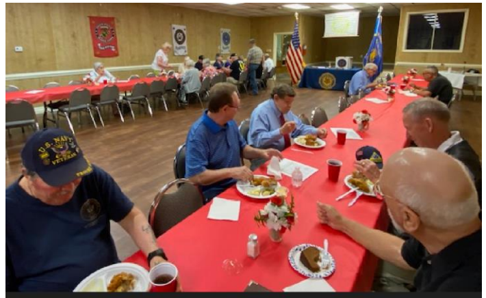
Good food, good friends.