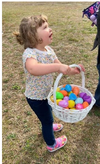
Someone is very happy.