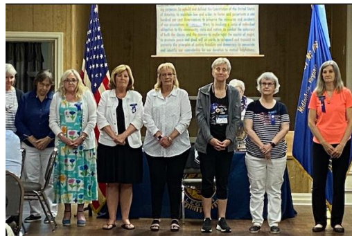
Auxiliary Unit 186 swore in their new officers.