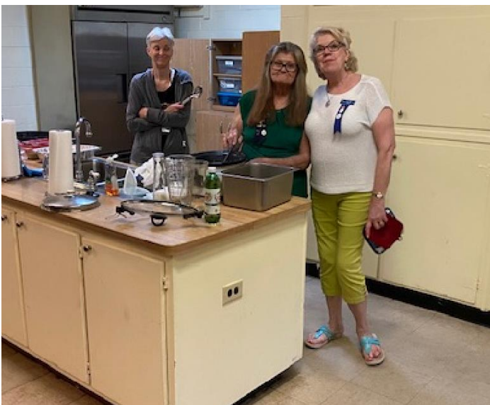
Behind the scene.