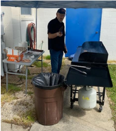
Hamburgers and hotdogs hit the spot.