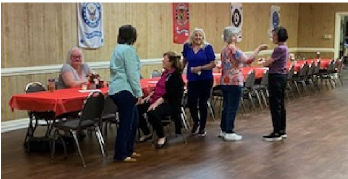
Waiting for business