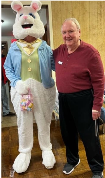
He made it!