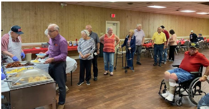
The breakfast chow-line