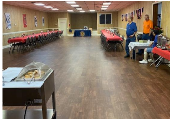
The chow hall is open, these guys are ready!