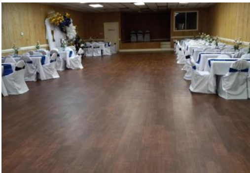
Looking good and ready for business!