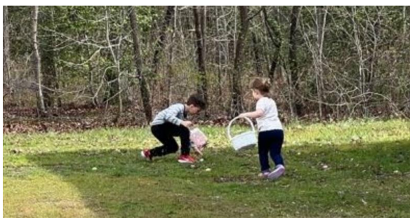
The Easter egg hunt is off and running!

The Congressman took questions from the group and stressed the importance of caring for the well-being of veterans and our military.