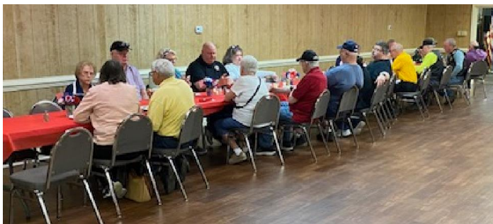
Time to dig-in.