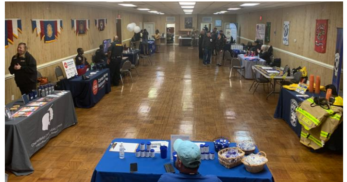
Everyone ready for the applicants to show.