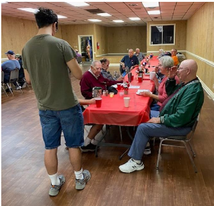
Great conversation along with breakfast.