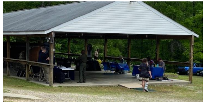
Vendors were also set up outdoors.