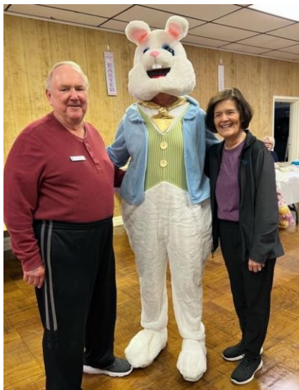
Everyone enjoyed his visit.