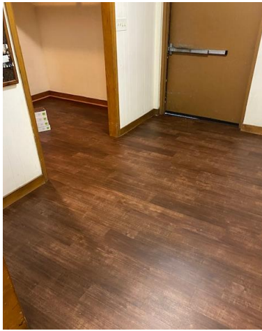
Entry way & Library