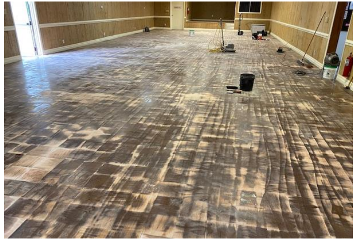
After the sanding.