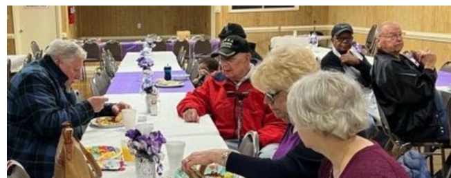
A few of the satisfied customers.