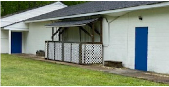
Repaired enclosure in the front of the building.