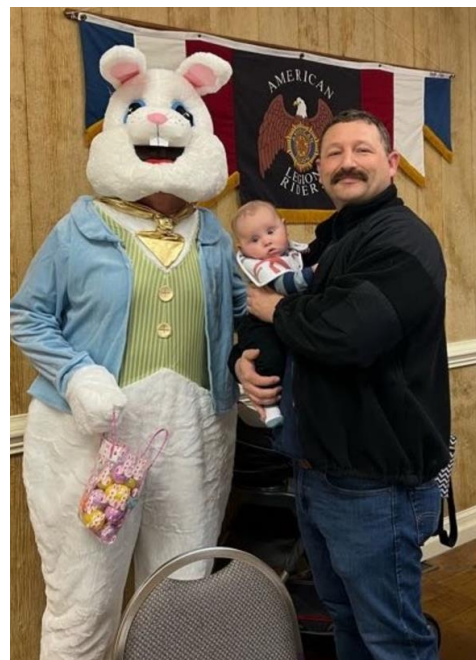
Young and old enjoyed Mr. Bunny.