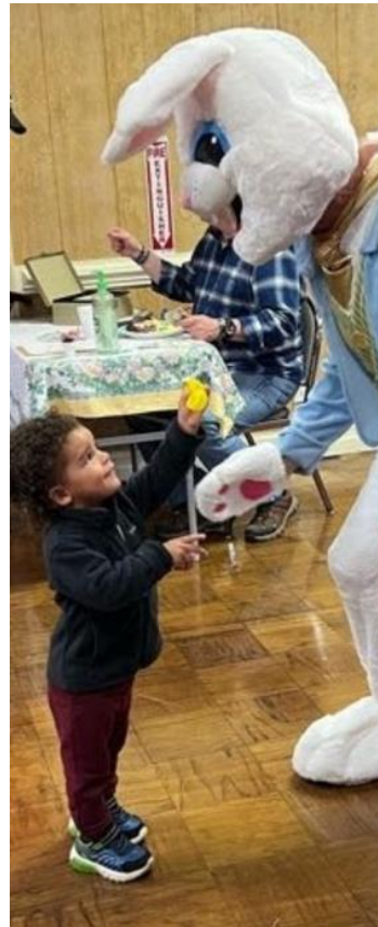
Showing the Bunny his egg.