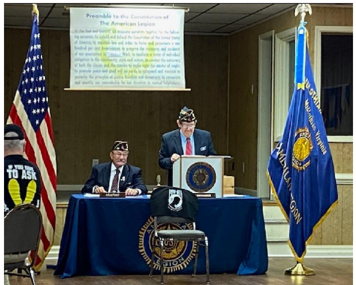
Meeting called to order.