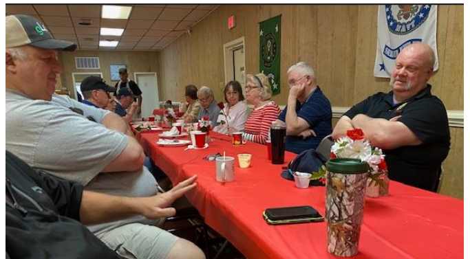
Pleasant conversation after breakfast.

As always, the breakfast was great. We hope to see each of you at future events here at your Post.