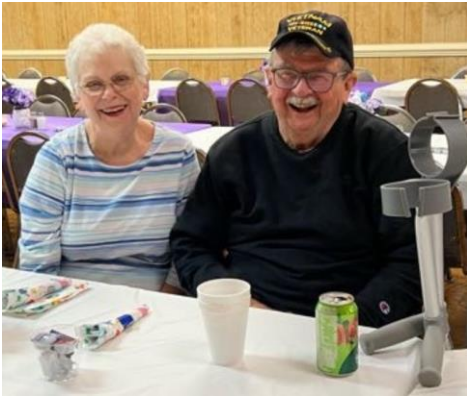
Waiting for the Bunny to show up.