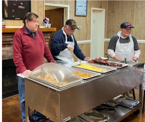
The Commander overseeing the servers.

The Honor Guard normally meets the 4th Tuesday of every month at 7pm.