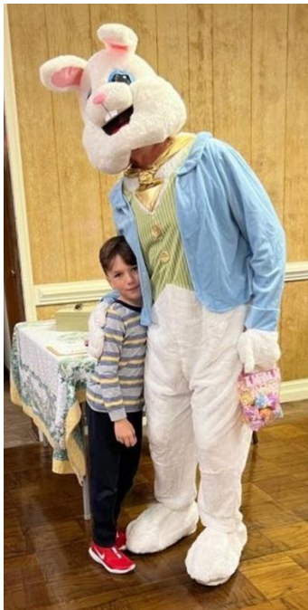
Didn't take long for the kids to find him.