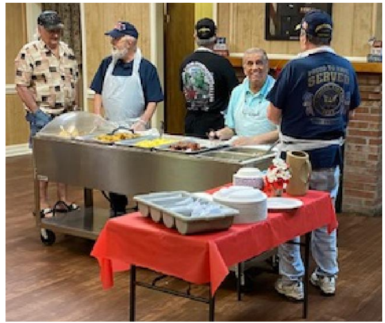
The crew of servers were ready.