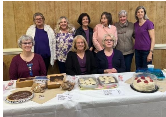
The most popular table at the Post.