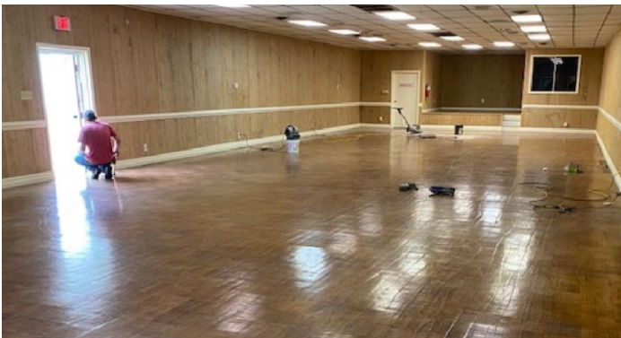
Let the work begin!

Work started on installing the new floor. Although work was delayed by one day, things progressed and at very quick pace. Stop by and check it out!