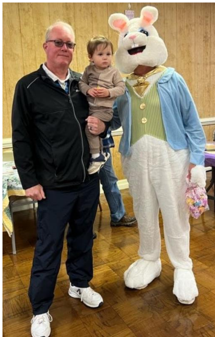
Little one taking it all in.