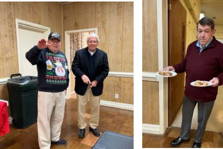
Standing room only?