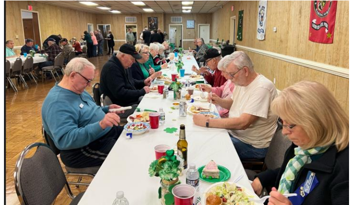
Dig in, there's plenty to eat.