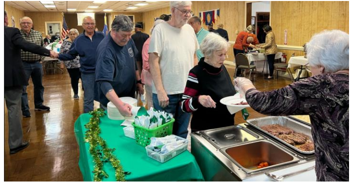
Come and get it!