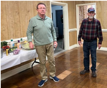
Don't just stand around, mingle.