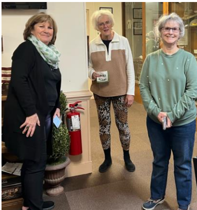
Waiting for the dinner bell to ring.