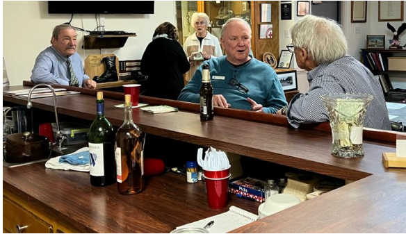
Perhaps a before dinner drink?