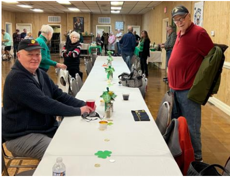
Take off your coat off and visit with friends.